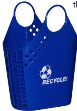
Apartment Recycling Bag

Under the direction of the Lewis University Environmental Risk Committee the Recycling Committee will develop and implement education and promotion activities in support of the recycling initiative. Campus Facilities will contract with Sodexho and Waste Management for the collection and transport of materials. The Recycling Committee will have student participation as well as representation from faculty and student services staff.