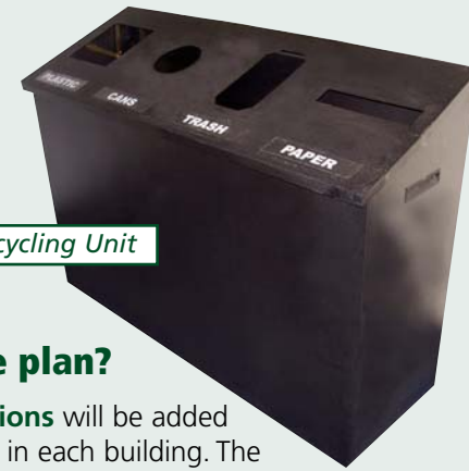
Multi-Sort Recycling Unit